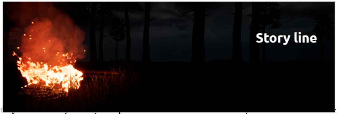
feels. You can only safely say that he is not comfortable and even scared. Only the darkness surrounding him, strange sounds, seclusion from oneself - all this only aggravates the situation. But that does not happen, he should answer himself to a few questions: